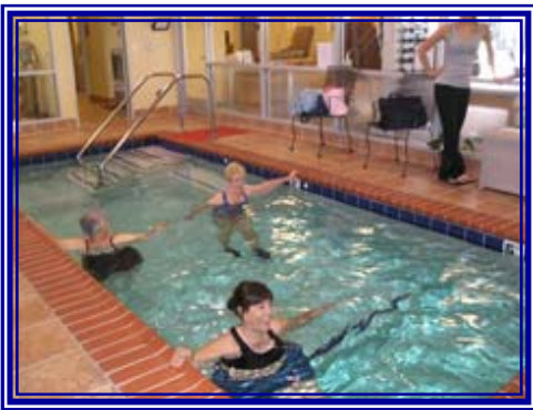
"Our 10 ft. X 20ft., 92 degree heated therapy pool"